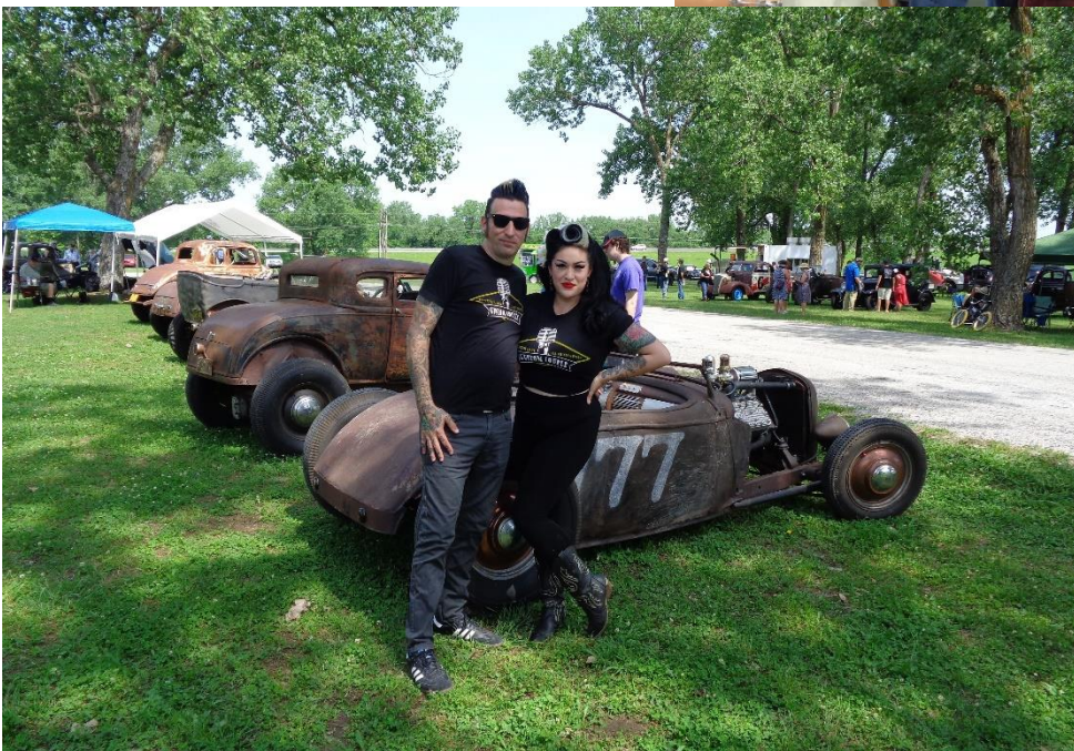
A neat couple posing with some of the pre-war pileup cars.