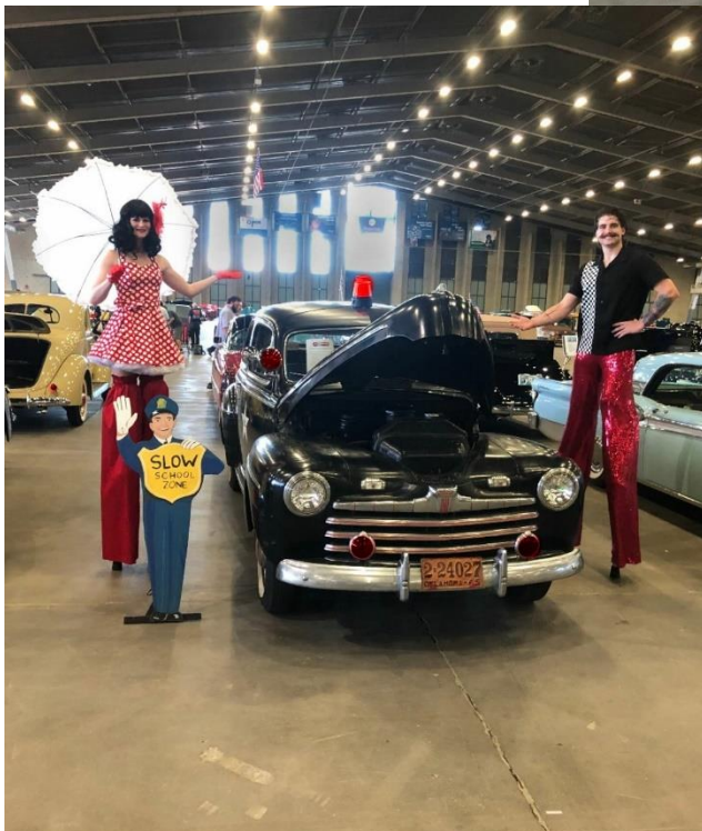
The police cruiser seems to be sitting pretty low