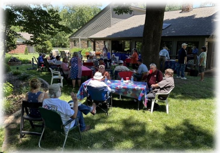
Enjoying the picnic