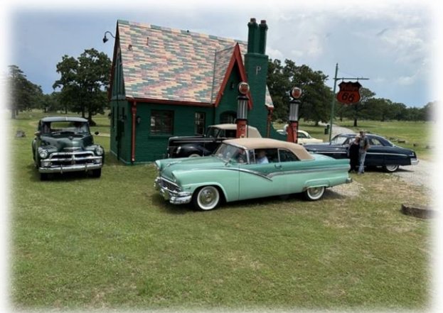
entrance to Woolaroc