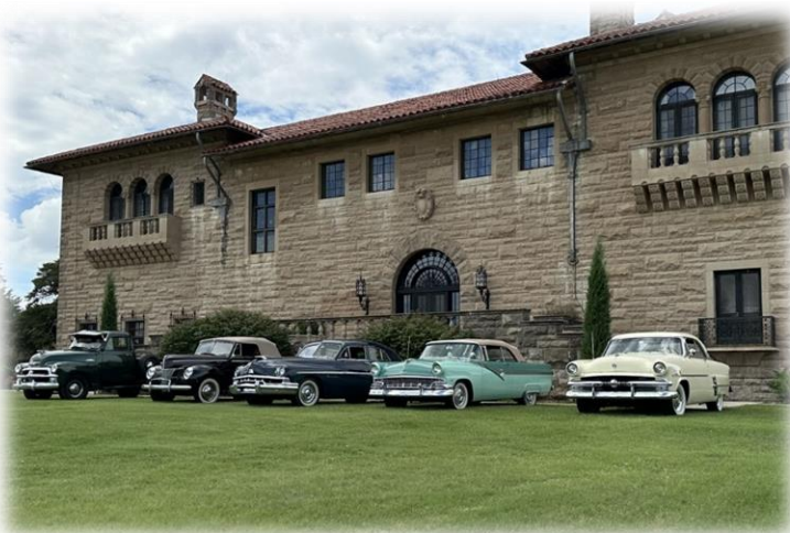
EW Marland Museum