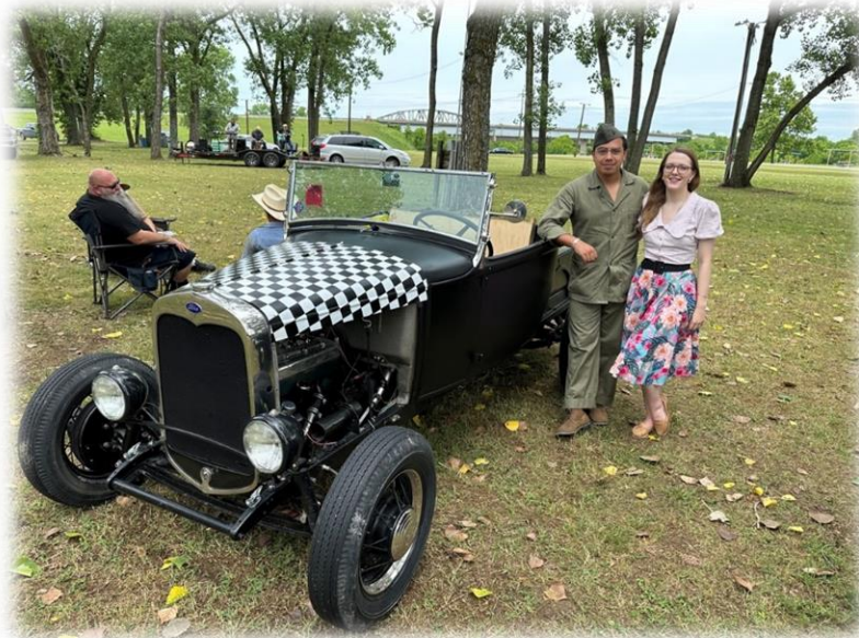
One of the cool cars at the Pileup!