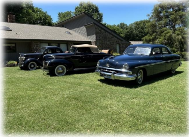
all 3 old cars that showed up!