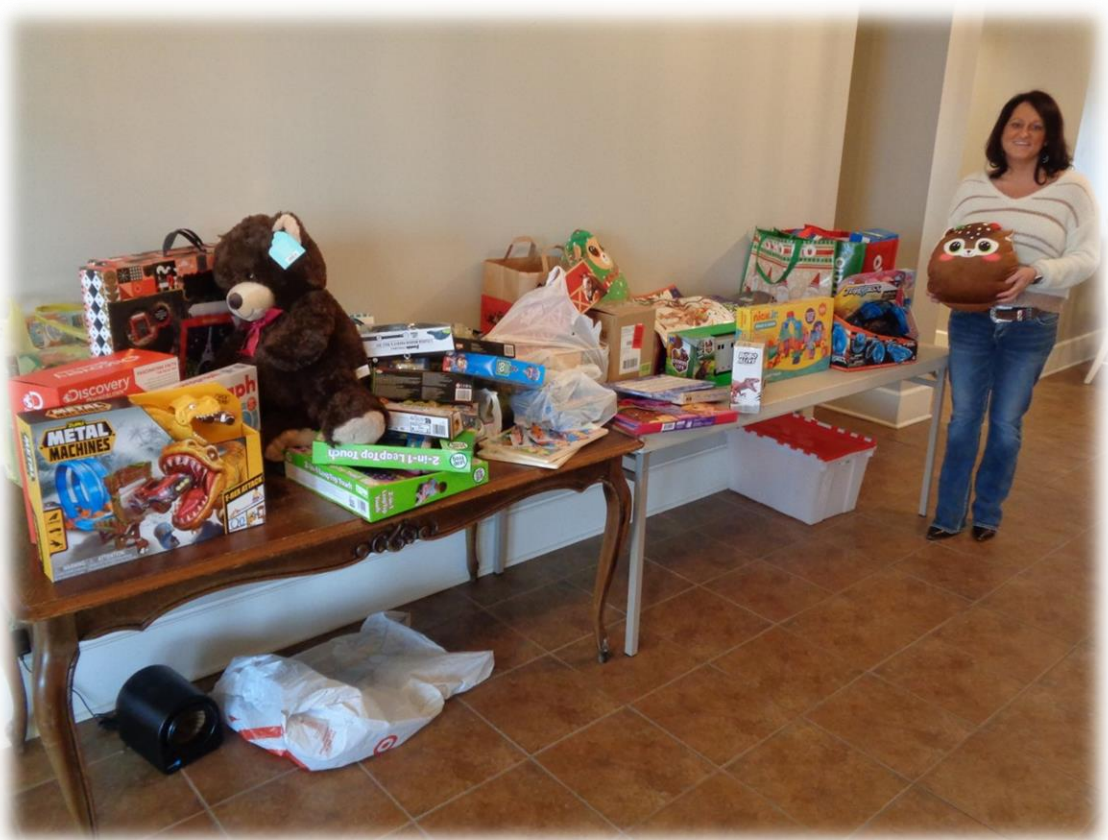
Donations to Cherokee Angel Tree accepted by Tiffani Eaton